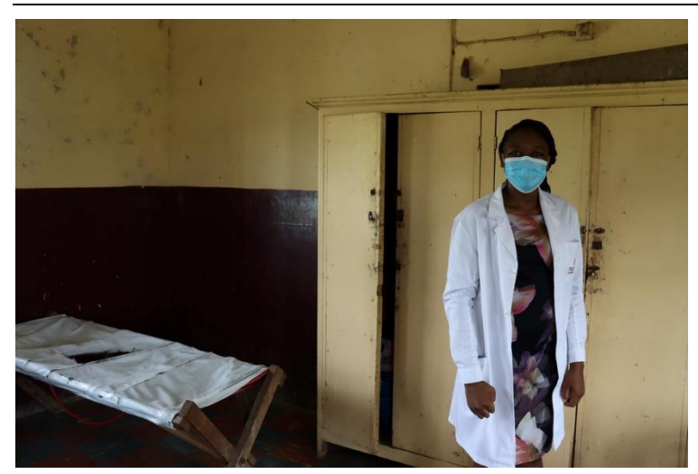
Tiko cholera response centre, South-West region

The South-West region, which has been the most cholera-affected region since the outbreack of the epidemie in October 2021, has recorded no cholera cases for two consecutive months. This is the result of the efforts of the Ministry of public health, with the support of humanitarian partners. Funded by the the central emergency response fund (CERF), United Nations Children's Fund (UNICEF) and World Health Organization (WHO) are supporting the health and WASH interventions to reduce cholera-related mortality, and curb the spread of the current epidemic.