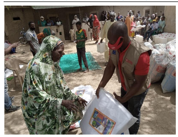
NFI distribution in Mada, Far North region

Since 2014, the Lake Chad crisis, characterized by armed violence, has spread across the Far North region of Cameroon, where hundreds of thousands of people have been displaced. This is compounded by climatic shocks, such as rain scarcity or abundant rainfall resulting in floods. In the North-West and South-West regions, populations have been forced to move inside the country and to Nigeria because of the crisis and insecurity.