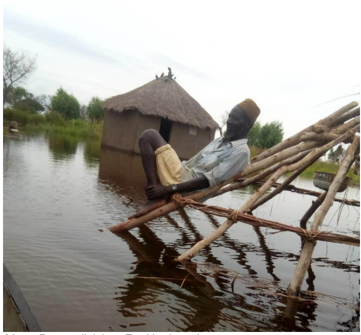
Mayo-Danay division, Far North region

Since August 2022, the Far North region has been experiencing floodings in several localities in the Mayo-Danay, Logone et Chari and Mayo-Tsanaga divisions. These floods are the result of heavy rainfalls, the overflowing of rivers and the breaching of dikes. On 17 and 21 September 2022, the protective dikes between Tékélé and Alvakai and Dibissa in Maga and Zina districts respectively were breached, resulting in significant material damage. The Mayo-Danay and Logone et Chari divisions are the most affected of the 11 concerned districts.